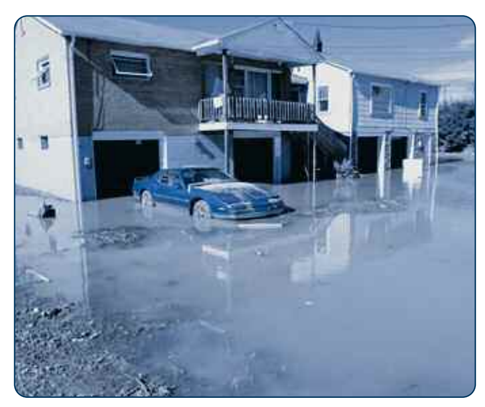
Flooding. Canton, NC, September 18, 2004

If your household uses a typical septic system, heavy rains and floods can halt its ability to treat wastewater from your home. When rainwater or flood waters pond over the drainfield, there is no place for wastewater from the household plumbing to drain because the drainfield and soil beneath are saturated, and your entire system can fail.